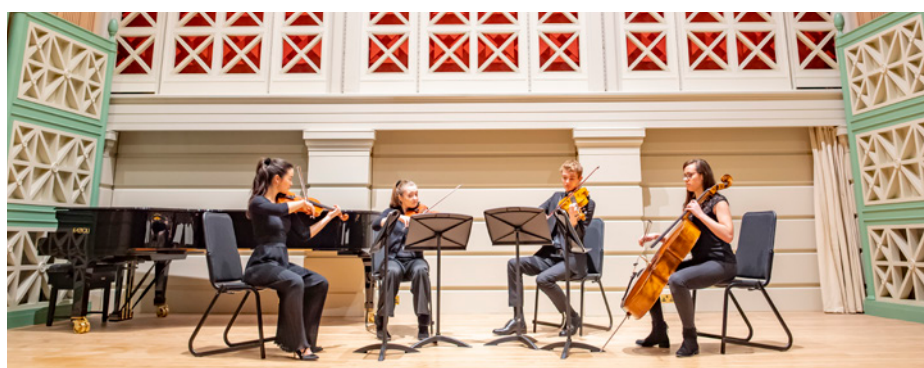
Opposite RCM Alumnus Sir Thomas Allen in RCM performance Die Fledermaus in Autumn 2015.

If you happen to be named as a beneficiary in a Will, it is possible to transfer a portion or all your inheritance to the Royal College of Music through a Deed of Variation. Not only is this a wonderful way to leave a gift in memory of a loved one, but also by utilising this method, gifts that are redirected to a charity become exempt from the Inheritance Tax. This can serve as an effective and meaningful way to support the RCM during your lifetime.